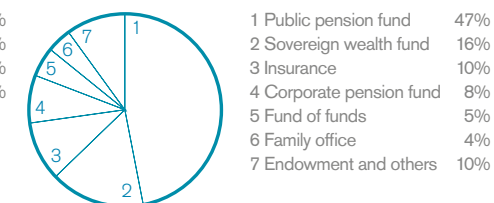
Current investors by type (by amount invested)*